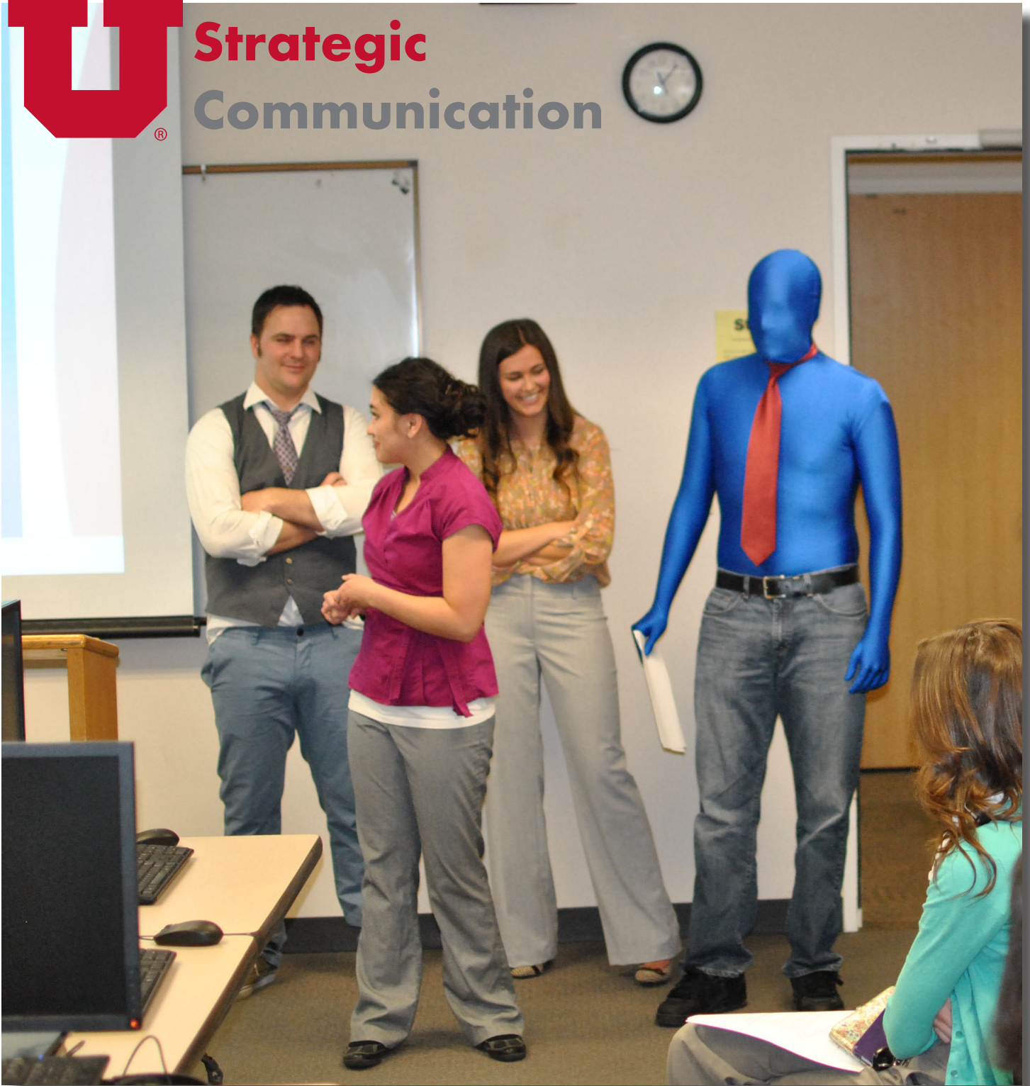
Strategic communication students present their campaign idea to the Utah Brain Injury Council.

Strategic communication is the study of persuasion, social influence, and behavior change. It is a popular focus area for Communication majors because it is the underlying framework for several growing professions, including public relations, advertising, and health communication.